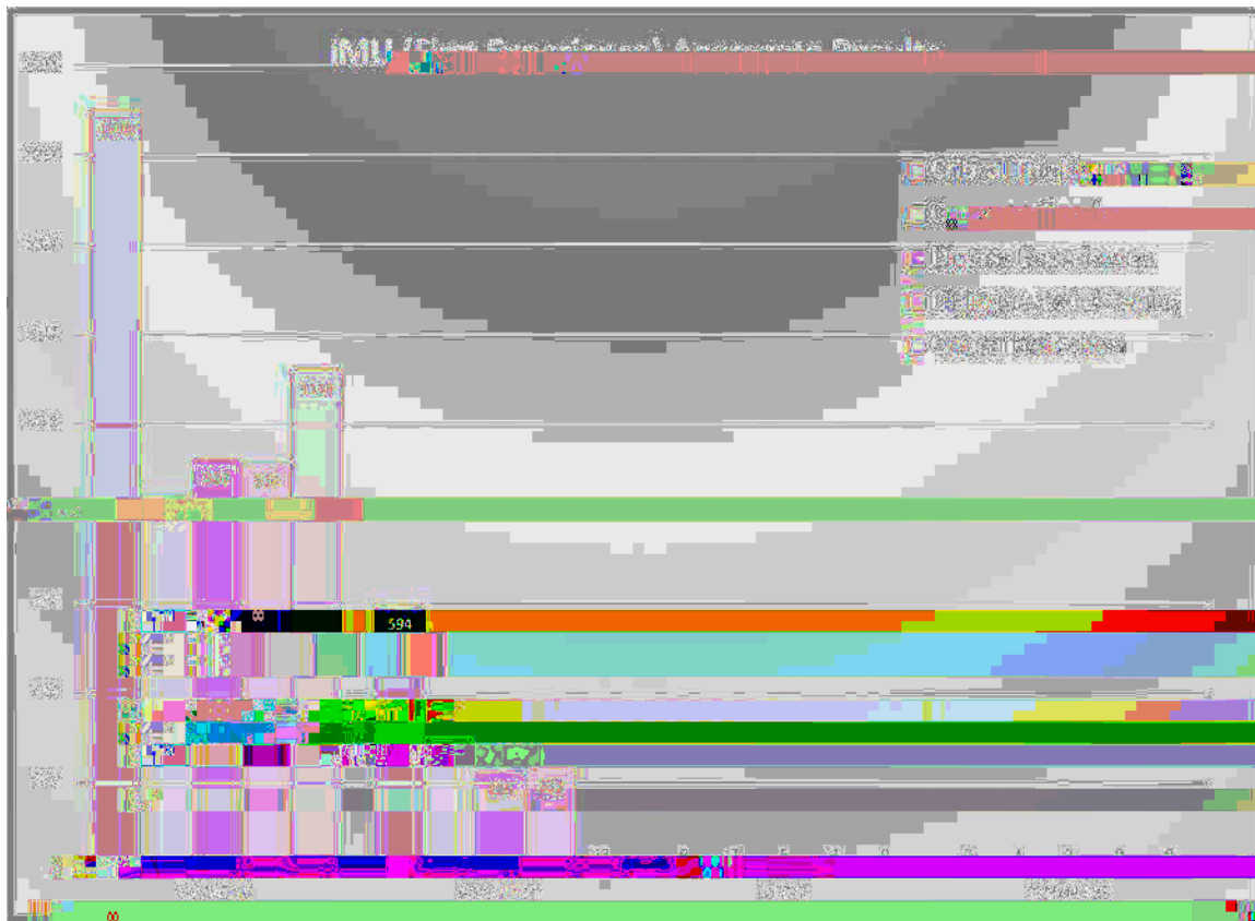
Figure 1 iMU Aggregate Rubric Data on all outREACH Learning Outcomes

Preliminary data from the first two cohorts of iMU and BTG participants show clear increases in student understanding and application of Mission. The charts below show the rubric score results for the aggregated iMU data (Figure 1) and the aggregated BTG data (Figure 2)